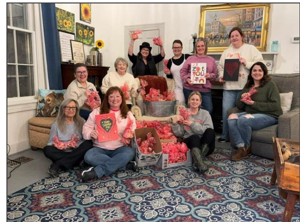
The ladies meeting to prepare items.