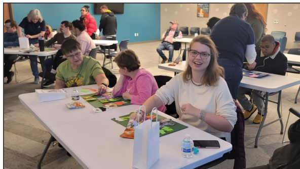
Crafting with Special Friends

Eight club ladies made centerpieces and head table decorations for the NW District Spring Meeting.