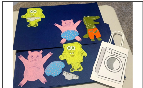
Our Craft Project