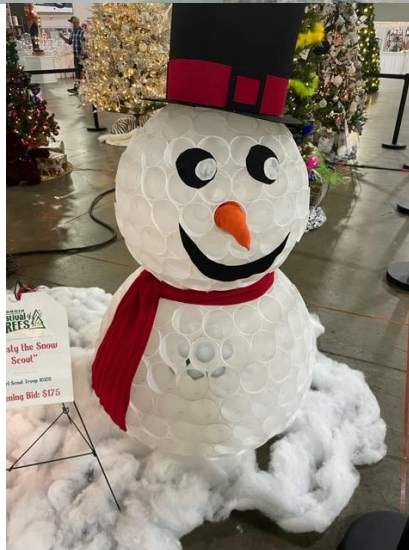
Recyclable Snowman made out of plastic cups.