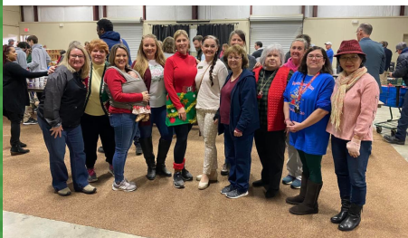
Lafayette Woman's Club - Empty Stocking event