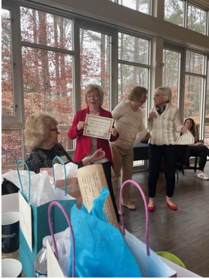
Happy 50th Anniversary Dunwoody Woman's Club