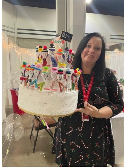
Marietta's Cake Sold for $100