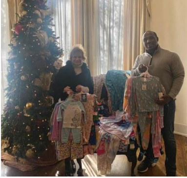
AWC had a "Holiday Pajama Program" and presented pajamas to the Partnership Against Domestic Violence, GFWC Presidents Special Project, Domestic Violence.

Cartersville Woman's Club members make homemade cookies for Tranquility House.