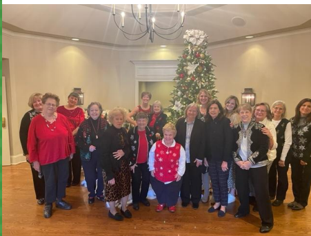
Marietta Woman's Club Luncheon