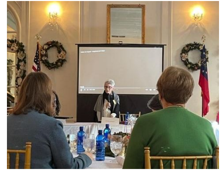
Atlanta Woman's Club holiday meeting. It's first in person meeting in two years.