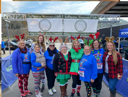
LaFayette Woman's Club's Reindeer Run event.