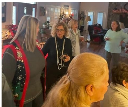
Cartersville Holiday Dinner